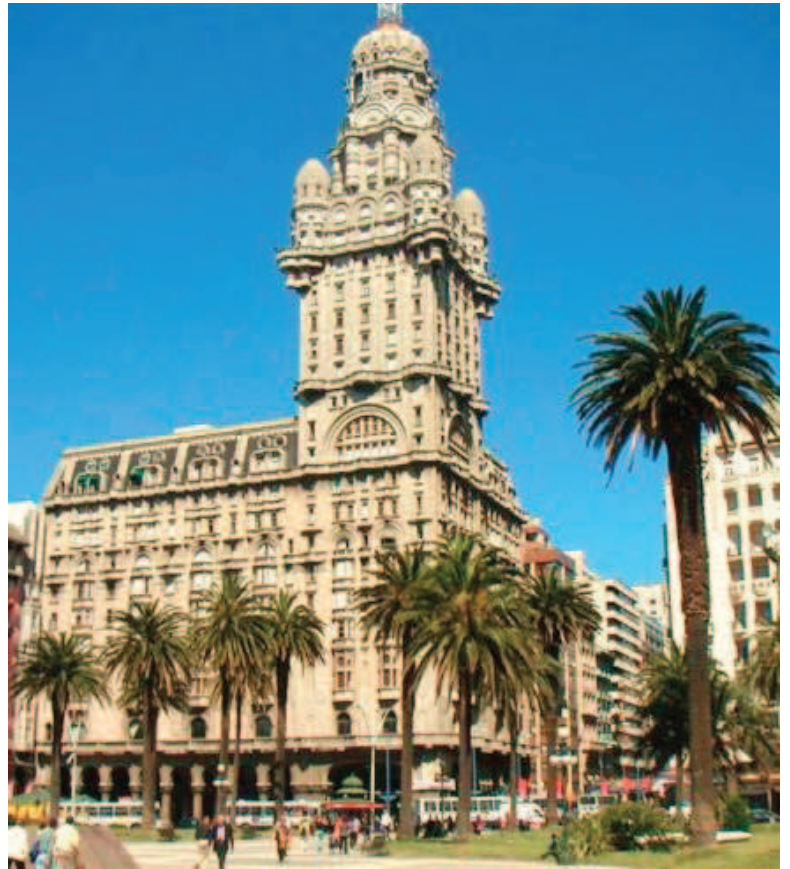
Uruguay : Old Architecture

http://www2.unwto.org/en/event/accesibilidad-una-ventaja-competitiva-en-los-destinos-turisticos