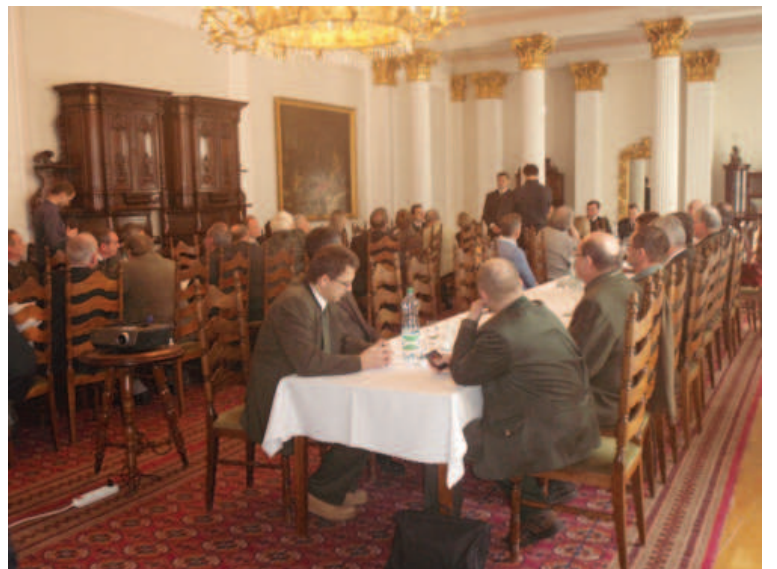
Meeting with Slovak Colleagues