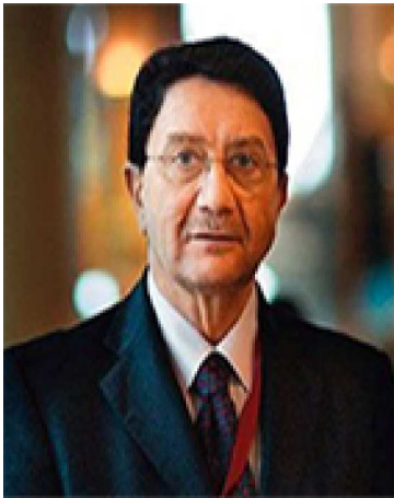
UNWTO SG TALEB RIFAI

International tourist arrivals grew by 4% between January and August 2012 compared to the same period of 2011 according to the latest UNWTO World Tourism Barometer. The resilience of international tourism in a continuing uncertain economy is further confirmed by the positive data on tourism earnings and expenditure. The number of international tourists worldwide grew by 4% between January and August 2012 compared to the same eight months of 2011 (28 million more) . With a record 705 million tourists up to August 2012, UNWTO remains confident that one billion international tourists will have travelled the world by the end of the year.