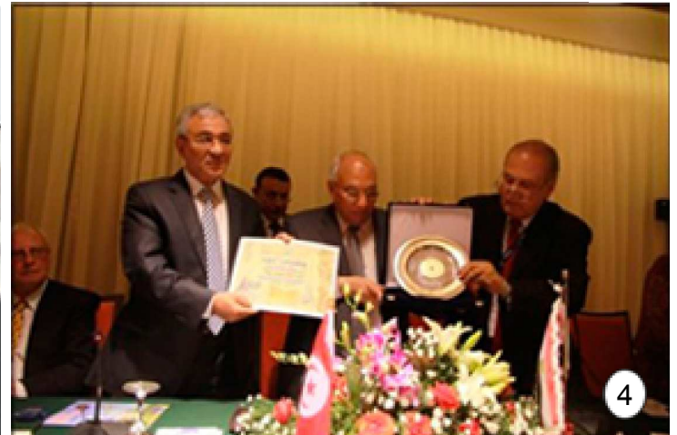
1 Cesky Krumlov - 2 "Walk of Peace" (Slovenia) - 3 Hamamönü( Turkey ) - 4 Alexandria ( Egypt )